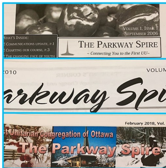
Mastheads from some old Spire issues.

Please take a moment to share your thoughts in a short, easy survey now posted on our website: (URL) or fill one out in the main office.