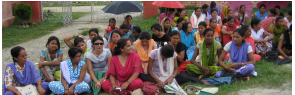
Gaighat, Nepal: These women are staging a sit-in to demand justice for a woman who was killed by her husband and mother-in-law.

On April 16, the Women's Foundation of Nepal, founded by Tara Upreti, held a constitutional assembly for over six hundred people. The attendees—including sitting and potential members