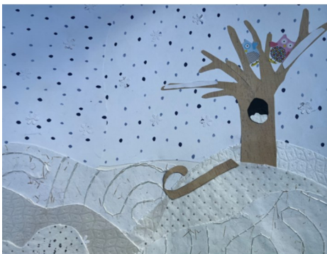
A reflection on “The Weight of a Snowflake” by Charlotte: Age 10

We shared The Weight of a Snowflake with the children in our Chalice room as part of our Spirit Stories program this past month. This story amazed me because it showed how something so small can have such a big impact. It made me think of the power of small acts, whether done by one person or by many. Sometimes we may feel that our actions are insignificant or unnoticed, but they can actually make a difference in the world. For instance, a small act of kindness can brighten someone’s day, a small donation can help a cause, or a small gesture can show support.