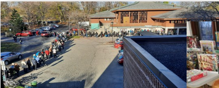
2023 Fall Fair Lineup