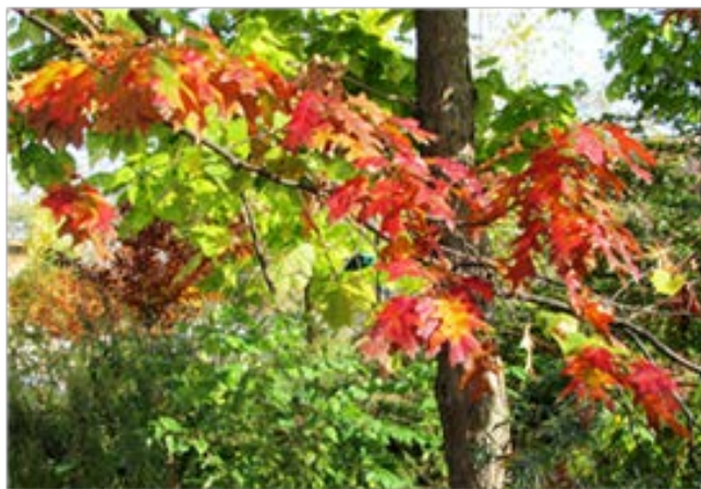
2014 Garden Calendar Cover

The Friends will be selling their popular Garden Calendar again during November and December—watch for us in Fellowship Hall. A 2014 calendar with thirteen gorgeous garden photos makes a wonderful Christmas gift. Contact: Alastaire , hendersalas@gmail, 613-562-2253.